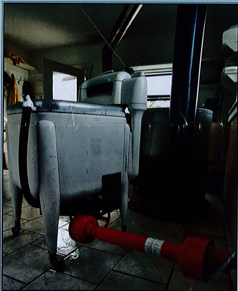
This is an installation that has been in use for 4+ years and provides very satisfactory power with a halflinger horse.