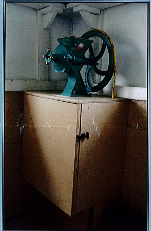
Grain grinder installation used to grind fresh flour after completion of laundry. Also powered by halflinger horse.

Varies with ramp angle, governor speed adjustment and weight of horse: 1/2 to 1 1/2 horsepower